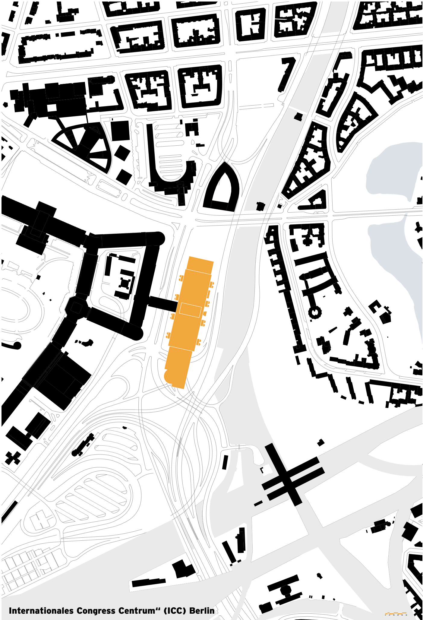
Internationales Congress Centrum“ (ICC) Berlin