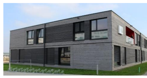
PopUp dorms: Flexible wooden pre-fabricated container constructions (2015)