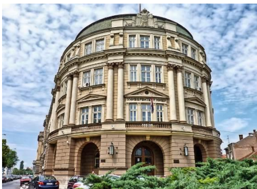
University of Niš

UNIVERSITY OF NIŠ FACULTY OF CIVIL ENGINEERING AND ARCHITECTURE