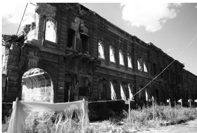
Image 2. Giumry, Armenia.