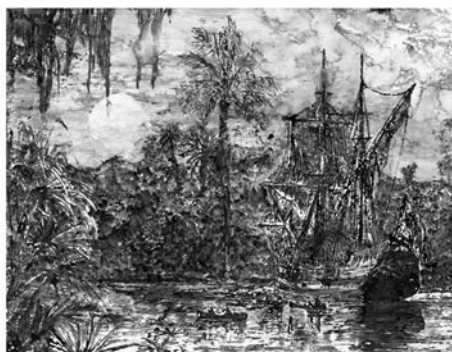
Image 10. Kasper Kovitz, Parime [Ponce de Leon], oxblood on paper 29 5/8" x 22 11/16", 75.2 x 57.6cm, 2010.

Kovitz uses post-painterly materials to make paintings: fox’s urine, bear scat, pine sap and coffee, amongst others. But these materials carry the traces of narratives in them, or rather; they are what I would call paradox-materials since they point to a referent that has escaped (Image 10). They function as indexes pointing to a story that has disappeared, as if from a crime scene. Here the story is not to be found behind the painting, but in the opacity of materials,