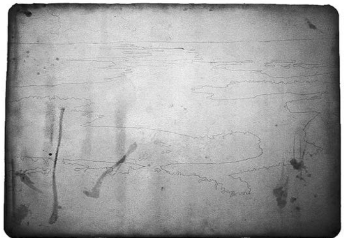
Image 6. Kasper Kovitz, Common Prayers - eucharist [Buzzard Roost; Lake Greenwood SC], pencil on discarded under-bed, 2000.