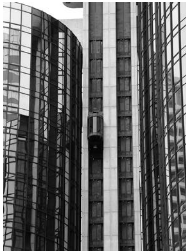
Image 3-4. Westin Bonaventure Hotel, Los Angeles. Photograph by Angela Harutyunyan, 2012.