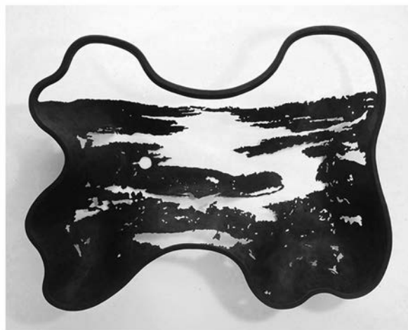
Image 7. Kasper Kovitz, Common Prayers - all the friends I ever had are gone [Buzzard Roost; Lake Greenwood SC], cutout pre-formed polyethylene pond, 2001. Courtesy of the Artist.

The series Common Prayers is based on an old postcard of Buzzard Roost; Lake Greenwood in South Carolina. What comes first is Common Prayers-Eucharist of 2001 – a pencil drawing on a dirty under-bed (Image 6). Here the fragile outlines of the landscape graphed with pencil on a discarded under-bed are punctured by stains embedded within the material. These outlines carry the memory of the stain, yet they reinvent the medium through their accidental character. The artist explains that he thought of the work as the "tabula rasa" that "land-takers" (in this case Puritans) hoped to find. "Eucharist" is referred to in its ancient Greek meaning of "Thanks Giving", but also as a religious