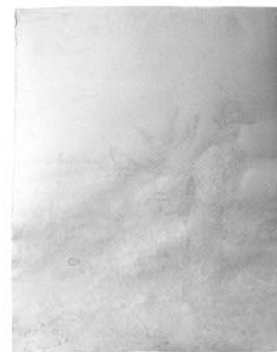
Image 11. Kasper Kovitz, No title; coyote urine; 2008; 9 1/2" x 12 3/8, 2009. Courtesy of the Artist.